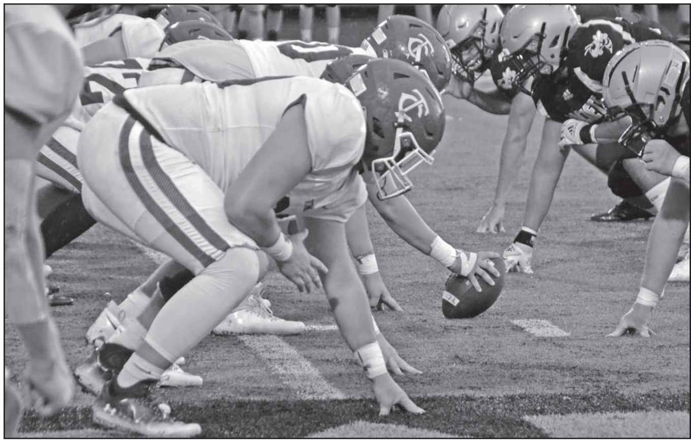
The Towns County front-five line up in the trenches on Friday night in Hayesville.

Visit www.townscountyathletics.com for complete season scheduling of all sports, and as always, Go Indians!