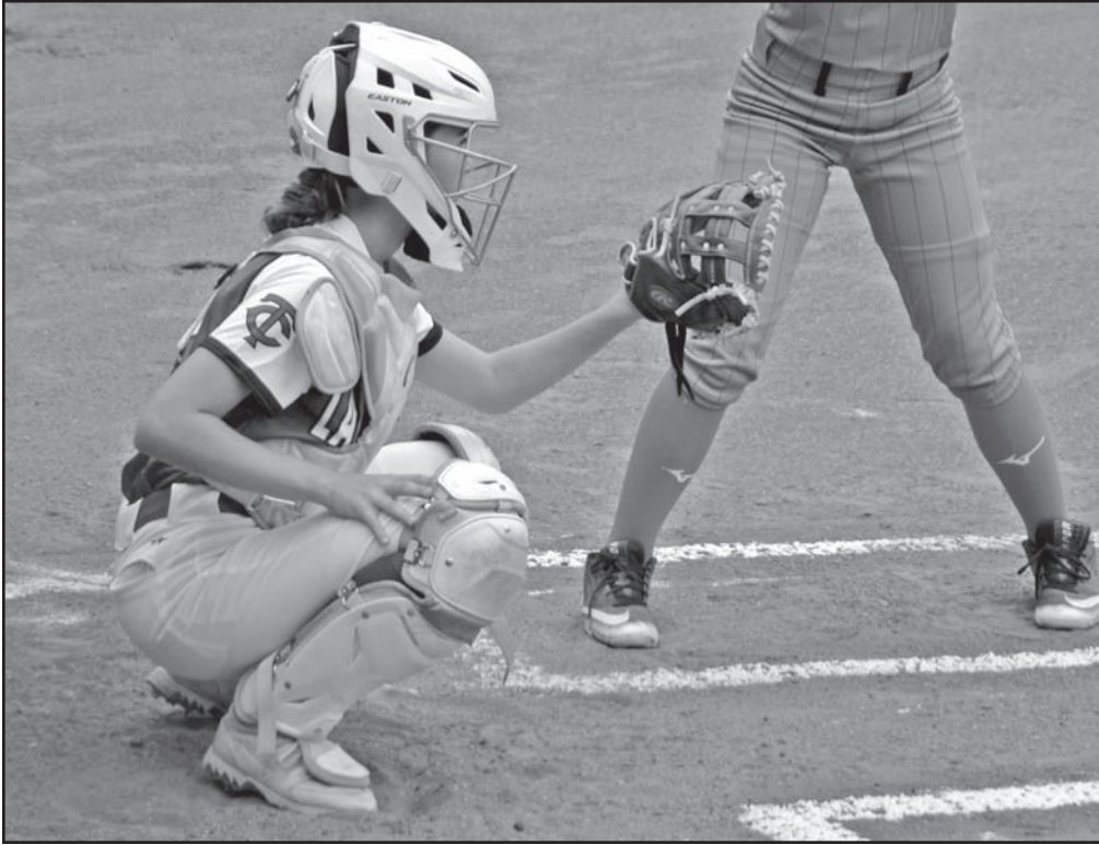
Towns County softball battles Rabun County at home in one of the two meetings vs. the Wildcats last week.