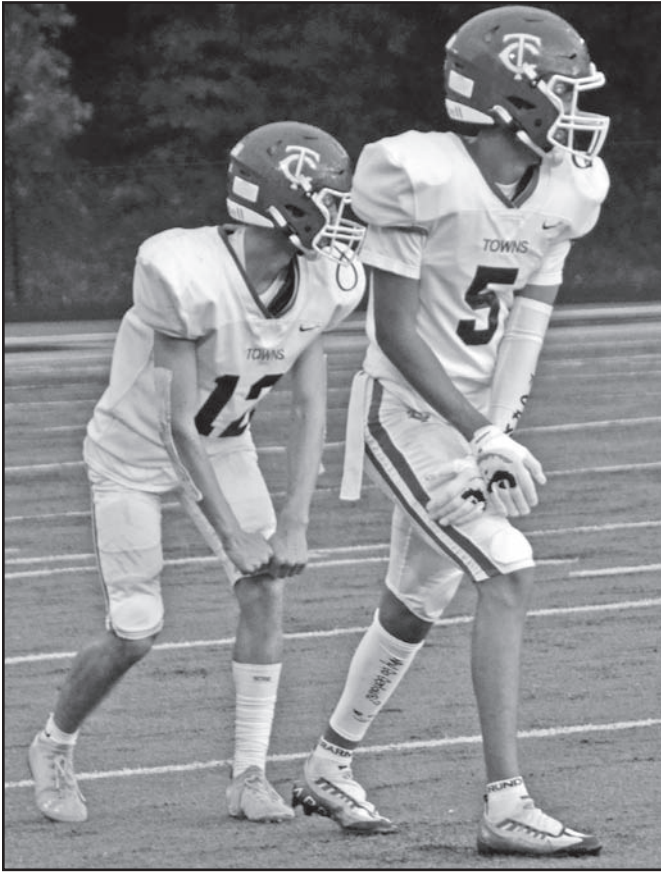
A pair of Towns County receivers line up out wide during the first half at Hayesville.

"Since summer training, I have been very pleased with